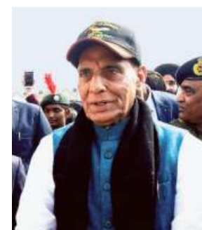
Rajnath Singh in Srinagar on Thursday.

"We feel the pain of residents of PoK, facing atrocities and violation of their rights at the hands of Pakistan. On this side, Kashmir and Ladakh are set on a new path of development and prosperity (post August 5, 2019). This is just the beginning. The mission will complete only when Gilgit-Baltistan and areas of PoK reunite with India. Also, when justice is delivered to the refugees of 1947 and they get their land and homes back. The day is not far away," Mr. Singh said while referring