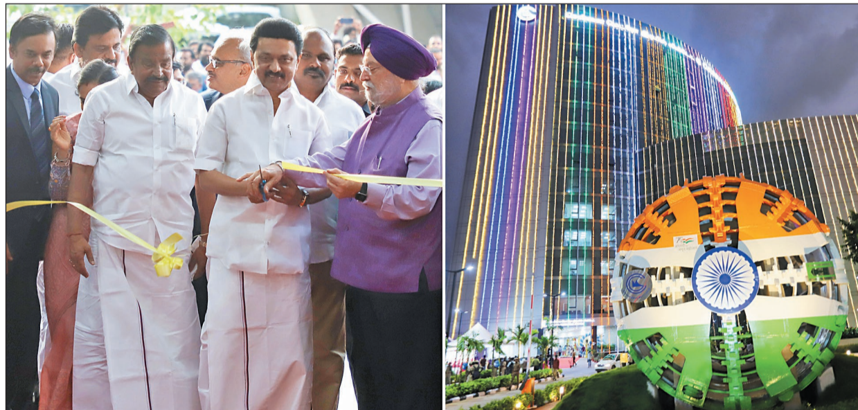
சென்னை நந்தனத்தில் ரூ.320 கோடி செலவில் அதிநவீன வசதியுடன் 12 மாடிகளுடன் அமைக்கப்பட்டுள்ள மெட்ரோ ரெயில் தலைமை அலுவலகத்தை முதல்-அமைச்சர் மு.க.ஸ்டாலின் திறந்துவைத்தார். அருகில் மத்திய மந்திரி ஹர்தீப் சிங் பூரி உள்பட பலர் உள்ளனர்.

நிலக்கரி சுரங்க ஒதுக்கீடு விவகாரம்: தேர்தல் கமிஷன் பரிந்துரைப்படி ஜார்கண்ட் முதல்-மந்திரி பதவி பறிக்கப்படுமா? கவர்னர் ரமேஷ் பயஸ் பேட்டி